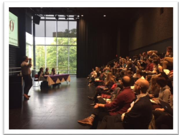
IPTD 30 th Anniversary Reunion and Symposium